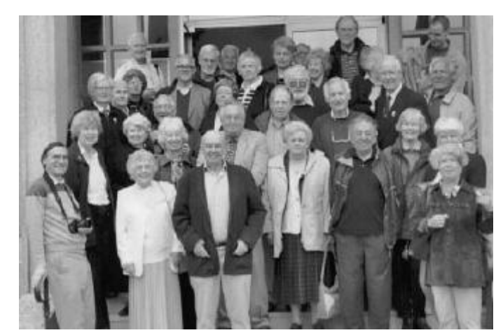
The 2003 Wimborne Twinners

The luncheon provided on Sunday by the Valognes Twinners in la Salle du Complexe Sportif was another gastronomic delight, and we left on Sunday evening wondering how on earth we are going to emulate such hospitality next year! This was a really excellent, warm, friendly weekend. The weather was generally drear but I'm sure that none of us noticed! A good time was had by all!